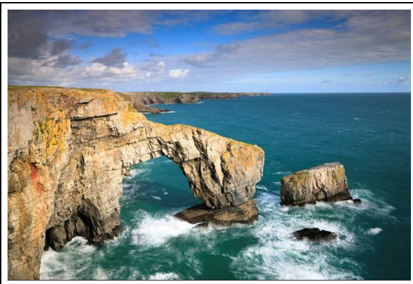
The Green Bridge of Wales near Stackpole

It is just 12 days to the Vernal equinox and the start of Astronomical Spring